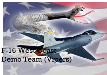
F-16 West Coast Demo Team (Vipers)